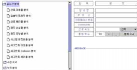
Fig. 3. user interface in client system

In the function of real-time analysis, the conditions for the current uses and fault of LAN are analyzed to provide a dynamic graphic view to help a user easily understand the network diagnosis. The result display of this real-time monitoring is shown in Fig. 4, which shows examples of graphs demonstrating line availability rate on LAN, real-time, and input and output traffic rate. Such setting helps optimize the management by presenting a simple application to the network management