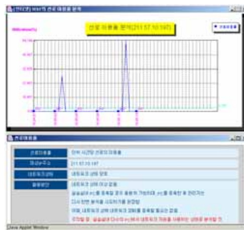
Fig. 4. Results of real-time analysis

In the function of real-time analysis, the conditions for the current uses and fault of LAN are analyzed to provide a dynamic graphic view to help a user easily understand the network diagnosis. The result display of this real-time monitoring is shown in Fig. 4, which shows examples of graphs demonstrating line availability rate on LAN, real-time, and input and output traffic rate. Such setting helps optimize the management by presenting a simple application to the network management