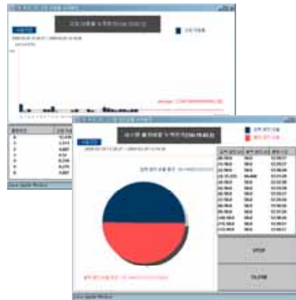
Fig. 5. Results of accumulative analysis

of the cumulated information during a certain period through a graphic view of various types. During the collected period, a user can compare pieces of information such as line availability rate, error rate and collision rate through various graphic views to identify the abnormality of LAN. Fig. 5 shows the result of this function.