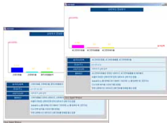
Fig. 7. Results of internet/intranet information analysis

And the proposed system can manage to PC-room without an expert skill by offering a variety application example. That is, a manager can check a managing status showing currently information and a simple application on each items. Fig. 6 shows the result of internet information analyses, which can to help managers perform network management.