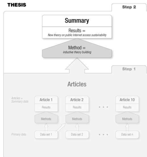
Fig. 1. Thesis structure: The Summary (Kappa) from [18]

The first method we examined was the grounded theory method (GTM), a classical method for theory generation. After studying basic GTM literature [5, 6, 7], literature on use of GTM in IS research [8, 9, 10], and some practically oriented papers [11,12], one central question emerged: “ Is it possible to start the GTM process (coding etc.) from the existing articles, and not from the primary data? ” (see Figure 1).