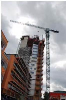
Fig. 1. Tornet (The Tower) during construction

The products which will be included in this study are plasterboards, doors and kitchens. The reasons why these particular products have been chosen are the following: plasterboards are chosen because of the common use of this product in the construction industry. Doors and kitchens are also chosen based on their commonality. Also, they have been subjected to delivery disturbances and quality problems for the examined construction site.