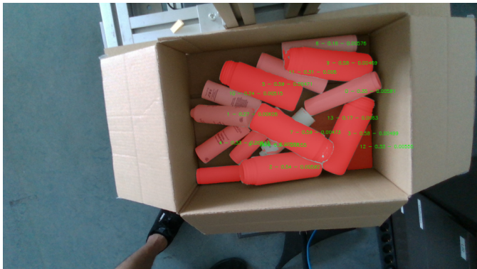
(a) The detected bottles using geometric and AI-based algorithms.