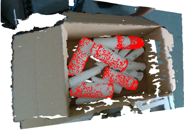
(b) The fitted point cloud to the detected bottles.