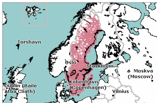
Fig. 1. GSM-network coverage of Sweden [18]

Nevertheless, even sparsely populated countries have invested in mobile networks, instead of providing fixed-lines in remote areas. One example is the GSM-network coverage of Sweden, which is shown in Fig. 1.