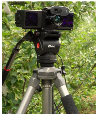
Fig.1. Dual-sensor vision system

Fig.1 shows a dual-sensor vision system, which includes a PMD Camcube3.0