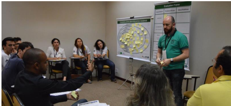
Fig. 1. Group discussion during the first workshop: SID (left) and EF (right).

The first workshop resulted in the identification of stakeholders and related problems and solutions. One of the SIDs shows a general concern with safety: smoke detectors, earthquake alarms and security cameras were some of the ideas for the source information layer of SID. The other SID layers from the first workshop had many contributions directed to pets: pet's cage and accessories (contribution layer), health insurance for pets (source layer) and animal welfare department (community) are some of the results. Fig. 1 illustrates a moment from the first workshop.