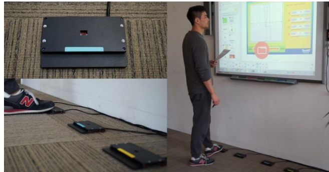
Fig. 1. FeetForward: a foot-based peripheral interface to support teachers' use of interactive whiteboards. See [14] for a demo video.

With the purpose of exploring how new classroom technologies can be designed to become peripheral and routine for secondary school teachers, this paper presents the research-through-design [12] study of FeetForward, a foot-based peripheral interface to facilitate secondary school teachers' use of interactive whiteboards (See Figure 1). We have deployed this simple yet new technology with three secondary school teachers in their classrooms for a period of five weeks. In this study, we used FeetForward as a technology probe [13] to gather implications for the design of peripheral classroom technologies. In particular, we aimed to study how FeetForward as a peripheral interaction design, could impact pedagogical activities, what may influence a new classroom technology to integrate into teacher's routines, and whether foot-based interaction styles were suitable for peripheral interaction.