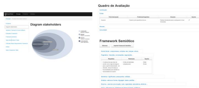
Fig. 2. The CASE tool's first version named WebPAM.

Considering that the SUS questionnaire scale ranges from 0 (worst possible score) to 4 (best possible score) mapped for Usability Goals [19], the 2012 version of the CASE tool had a score between 2 and 3 for Effective (effective to use), Efficient (efficient to use), Utility (have good utility) and Learnable (easy to learn). Memorable (easy to remember how to use), in turn, had a score lower than 2. Even though the overall results are positive, the results indicated that the CASE tool could be improved in several aspects, including usability and accessibility ones.