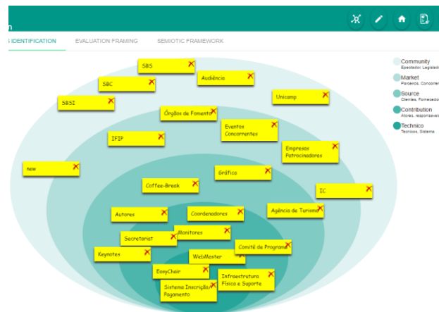
Fig. 4. SID for ICISO'16

This activity involved a group of 10 people with experience in using OS artifacts and in organizing conferences. Because the participants were experienced in both OS and the problem domain, this was considered an ideal scenario to evaluate the current version of the CASE tool in terms of possible conceptual problems, technical issues and overall usability. This scenario also highlights how the CASE tool can be used for a wide range of problem understanding contexts, not only the development of a technological product. Fig. 4 illustrates the beginning of the planning activities, in which the group uses the SID to list and map every stakeholder that is involved and may somehow affect/be affected by the conference. Participants identified and mapped stakeholders from different layers, for instance, while technical stakeholders (e.g., EasyChair) are placed in the onion's core, social ones (e.g., Audience) are placed in the outermost layer of the onion.