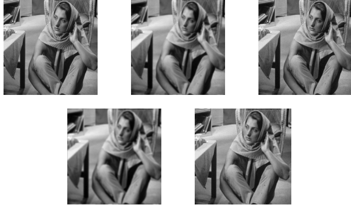
Fig. 1: Top line: exact image (left), Gaussian blurred image (middle) and MNP reconstruction (right). Bottom line: out-of-focus blurred image (left) and MNP reconstruction (right). The noise level is NL=7.5 \cdot 10^{-3} .