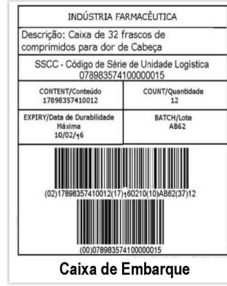
Fig. 2. Label aggregation

and constitute a new code. This new label "father" must be fixed in the shipment box to identify the "children" [8].