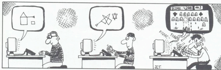
Fig. 1. ‘TodoSpectrum’ magazine, May 1985 [14: p.13].

when tinkering with their computers. Regarding this, Gerard Alberts and Ruth Oldenziel note that ‘playfulness was at the heart of how European players appropriated microcomputers in the last quarter of the twentieth century. [...] Users playfully assigned their own meanings to the machines in unexpected ways’ [13: p.1]. The following cartoon, taken from a 1985 Spanish computing magazine, is a suitable example of how playfulness was experienced whenever some of the users sat in front of their computer screens: