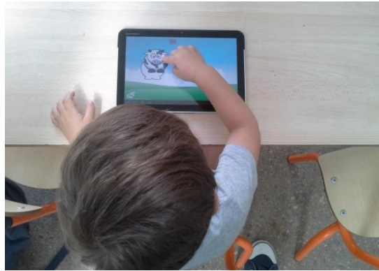
Fig. 2. Pre-kindergarten child performing the drag task.

significantly higher levels of accuracy and, therefore, future multi-touch application for this age range should consider assistive strategies that adapt their behavior to the actual levels of motor and cognitive development of each child. Not doing so, would prevent the more skilled children from exercising and further enhancing their precision related skills at an early phase of their development.