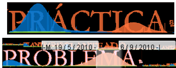
Fig. 1. On up,the representation of a single tag on Temporal tagcloud, on down, “view of tag problema”.

The main goal of the visualization is to provide a compact representation of the forums' interaction on VLE overall use, and its evolution over the time. Usually, a tagcloud presents a certain number of most often used tags in a defined area of the user interface. A tag's popularity is expressed by its font size (relative to the other tags). Next to their visualization function, tagclouds are also navigation interfaces as the tags are usually hyperlinks leading to a collection of items they are associated with. Furthermore, several layout variations emerged on the basic design principles of tag clouds. Also the representativeness evolution of each tag over the time is one of the goals of the representation. Fig. 1 up provides an overview of a tag with its three main components: the bar-graph, wave-graph representation and the tag. The bar-graph and wave-graph representation curves, shown in the Fig. 1, shows the significance of document content, represented by a word, over time. The size of the words font represents the meaningful of the word on forum activity of the VLE.