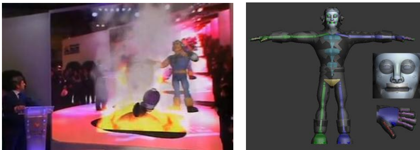
Fig. 3. Augmented mirror (left); avatar skeleton (right).

experience. A Kinect camera is used to capture the real image of the audience which is used in both scenarios. In the control scenario the real actor can see the audience to interact with them, while this image is merged with the avatar and the virtual elements to generate the augmented mirror image. The occlusion handling is implemented on a GPU shader, which takes the real image and the depth information captured by Kinect, mixing it with the virtual scene. The implementation of the augmented visualization is based on OpenSceneGraph, Cal3D and our own developed libraries. The avatar skeleton (see Figure 3), has been designed to perform all the gestures and facial expressions desired.