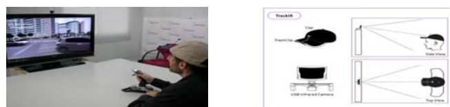
Figure 1. Overview of the VRSCT and description of tracking system.