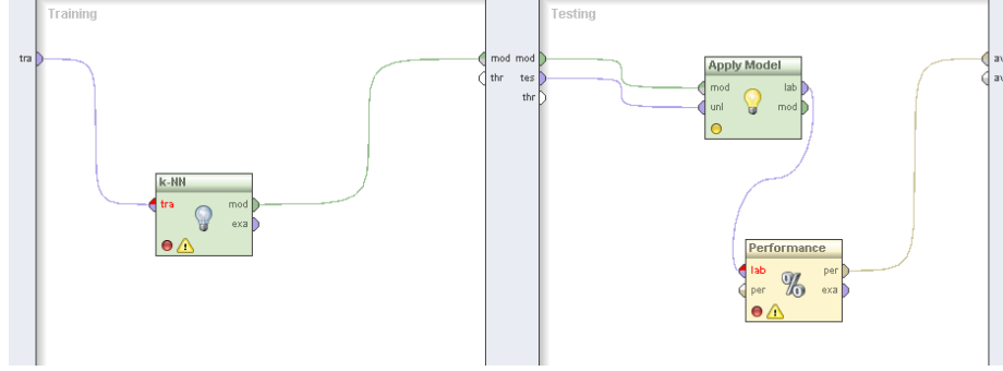
Fig. 2. The embedded training and testing process for a k -nn classification model in Rapidminer workflow.

one-out resampling technique. It is important to note that applying and evaluating a classifier within Rapidminer is a rather simple procedure, given that the user has set the implementation details of the classifier (e.g. number of neighbor for a k -nn classifier), the validation procedure to apply, and the attribute of the examples set fed to the classifier that will be used as a target class.