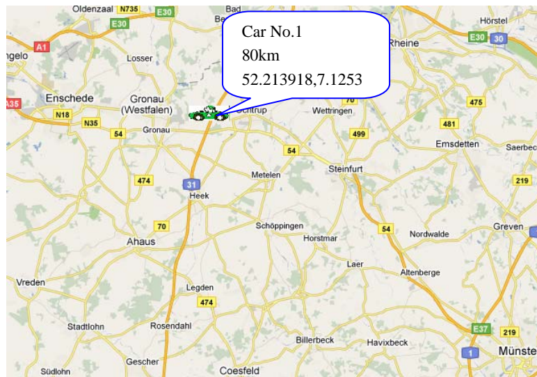
Fig. 4. GPS system monitoring interface sketch