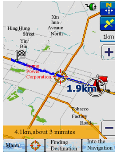
Fig. 2. To start navigation