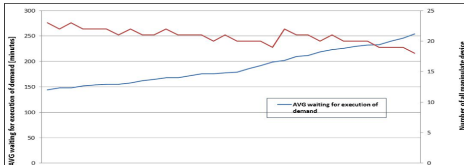
Figure 2. Contradiction of optimization criteria

A compromise between both contradicting criteria, see Figure 2, can be called the point of balance. The balance point in this case is understood as a generic term. A preview of an intersection of the two criteria is also shown in Figure 2.