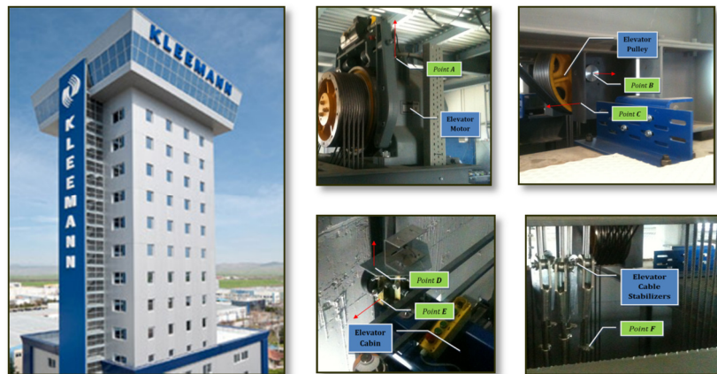
Fig. 2. WelCOM Testbed Planning

The development of WelCOM's mobile client drives an assessment of direct and indirect methods for inferring maintenance related contexts. One of our main tested sites is the Kleemann's lift testing tower. This tower is equivalent to a seventeen floor building, and comprises four testing units. The WelCOM intelligent advisor should be able to monitor, map and analyze a set of condition parameters related to lift operational parts and components (Fig. 2). The lift testbeds themselves are technical structures composing an integrated lift machinery installation.