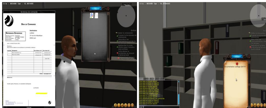
Figure 2 Screen shot PEGASE: player collects product data

This project was a success by showing that we can improve change management by using a Serious Game. However, the construction of a Serious Game is very expensive, it does not fit the limited funding of a small and medium sized company.