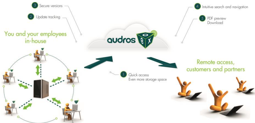
Figure 4 Audrosbox