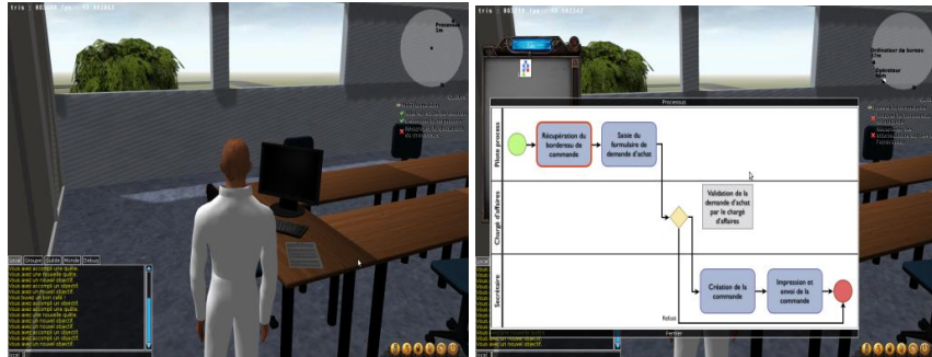
Figure 1 Screen shot PEGASE: player interacts with its environment