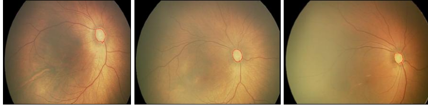
Figure4. The optic disc edge results with the third feature added.