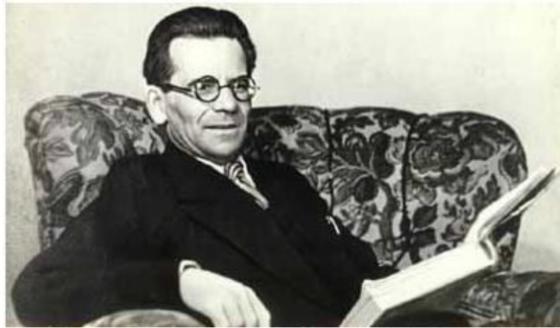
Fig.1. Sergey Lebedev

Described by some as the “Soviet Alan Turing,” Sergey Lebedev had been thinking about computing as far back as the 1930’s, until interrupted by war. In 1946 he was made director of Kyiv’s Institute of Electrical Engineering. After the second war some stories of “electronic brains” in the West began to circulate and his interest in computing re-vived.