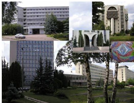
Fig.4. Cybernetic Center NASU planned by V.Glushkov in 1972 was organized in 1992. The main organization - V.Glushkov Institute of Cybernetics of the National Academy of Science

Author of this paper was working for the Institute of Cybernetics in 1980-86 and has started then General Knowledge Machine project.