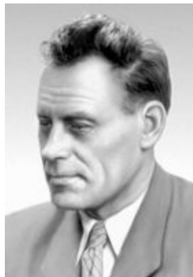
Fig. 3. Mikhail N. Livanov, the Soviet physiologist, academician of the Academy of Sciences of the USSR

Mikhail Nikolaevich Livanov, born October 7, 1907 in Kazan was graduated from Kazan state University in 1931 as physiologist and became academician of the Academy of Sciences of the USSR in 1970.