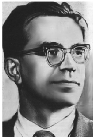
Fig. 3. Victor Glushkov

Victor Glushkov (August 24, 1923 – January 30, 1982) was the founding father of information technology in the Soviet Union (and specifically in Ukraine), and one of the founders of Cybernetics. He was born in Rostov-on-Don, Russian SFSR, in the family of a mining engineer. He was graduated from Rostov State University in 1948, and in 1952 has proposed solution to the Hilbert's fifth problem and defended his thesis in Lomonosov Moscow State University.