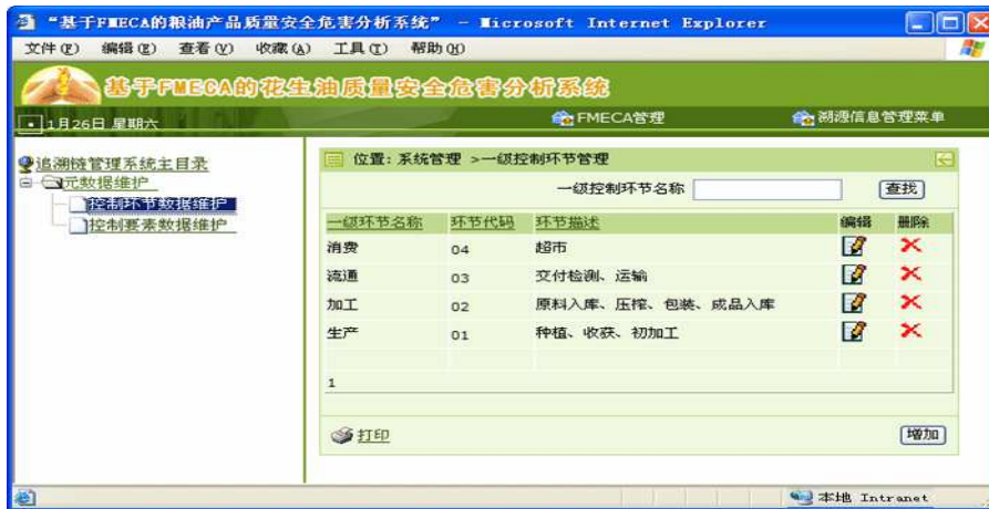
Fig.6 Traceability metadata management sub-system

traceability. These metadata will be used in every phase to describe the features of every product.