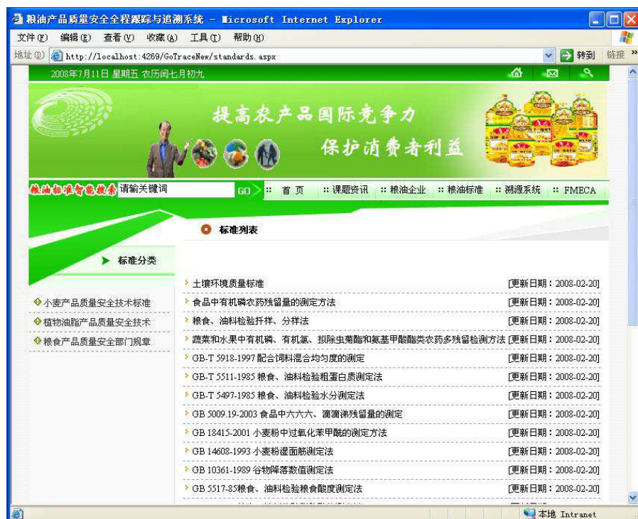
Fig.4 The standards management system in the traceability system

Fig.5 is the expert points function page of FEMCA analysis system. Experts can evaluate the basis of the traceability, the features of every phase, the control measure, and give every indicator a score.