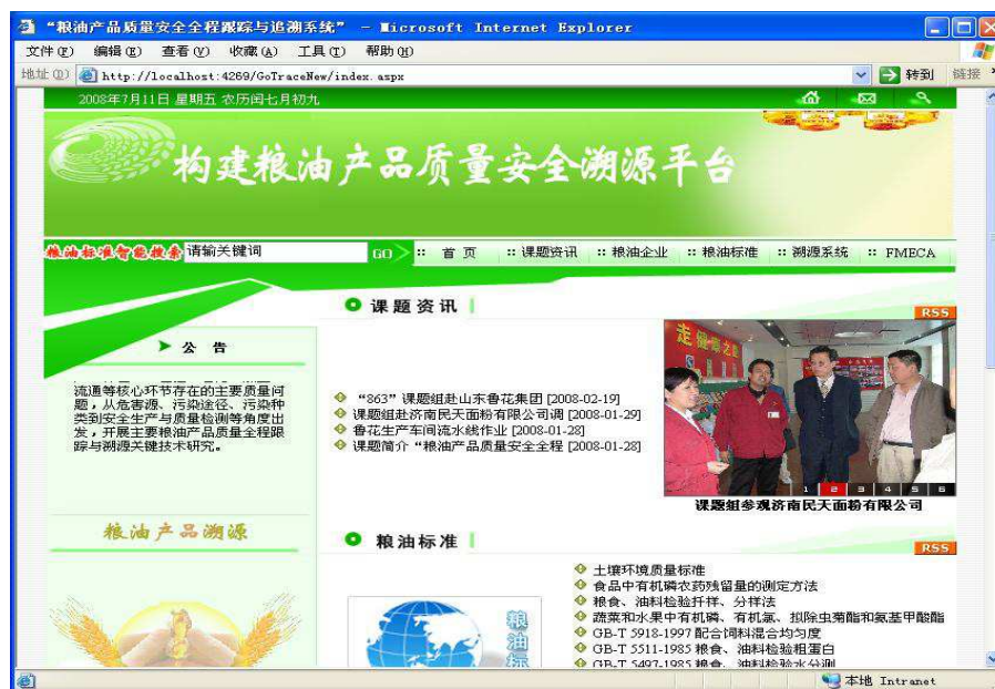
Fig.3 The portal homepage of the system

Fig.3 is the portal of the traceability system. From this homepage, user can visit the related information, and navigate to the subsystem, subscribe related information through RSS, and retrieve the traceability information inside the application.