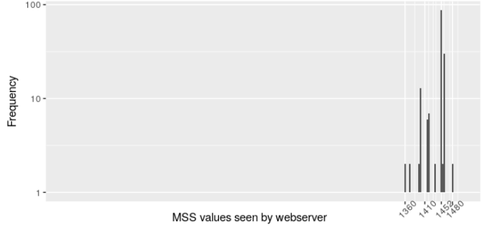
Fig. 2. Observed MSS Values for RIPE Atlas test

MSS, as validated in Section V-D. For these 10 paths, we also sought to determine which mobile network inserted the MSS option. We found a variety of networks, displayed in Table IV.