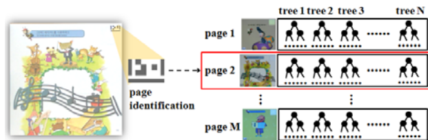
Fig. 1. The concept of Hybrid Visual Tracking

key idea is that page identification is performed with fiducial marker detection, and camera pose estimation is performed with randomized trees. We will call fiducial marker for page identification as page marker. Fig. 1 shows each page has the trees for keypoint matching. The page marker supports just page identification. After page identification, the system loads the trees for the identified page, performs keypoint matching, and eliminates outliers of a matching result using RANSAC algorithm. If correct matches are enough, the system performs the pose estimation proposed in our previous work [3], otherwise the system detects a page marker because it is likely that the current page is changed.