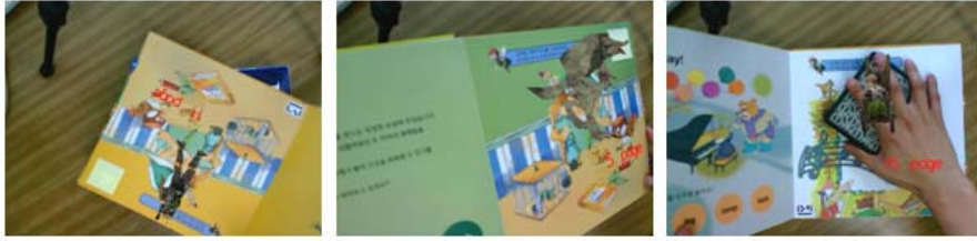
Fig. 4. Pose estimation under ( left and middle ) viewpoint changes, ( right ) serious occlusion

Table. 1 shows the average amount of time needed for a 2500 frame video clip for 15 pages. As expected, the page marker detection takes so little time that it does not have an effect on performance. After loading the tree data, only 22.49ms was needed to finish the pose estimation process. That means the proposed method can achieve 44.46 fps ideally.