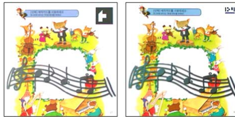
Fig. 2. (left) a page with a traditional fiducial marker, (right) a page with our page marker

In hybrid visual tracking, a page marker is just used for page identification not for camera pose estimation so that we can reduce the size of a marker and don't need to design the shape as rectangle or circle. Therefore, a page marker can be designed in various ways not giving visual discomfort. Fig. 2 shows that our page marker is very small compared with a traditional fiducial marker. Our marker size is only 2cm x 1.3cm. In addition, randomized trees support only one page and the system loads the trees for only the current page, so we can optimize the memory space and achieve fast matching and high correct matching ratio. Compared to fiducial marker tracking, keypoints spread widely, so more accurate and stable camera pose can be estimated.