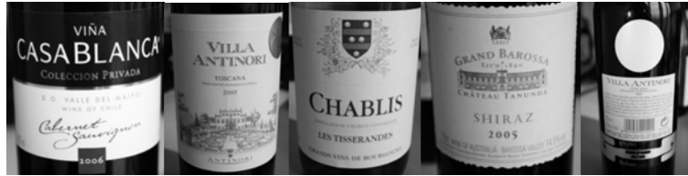
Fig. 1. Labels and tagging of the wine bottles used

name label. In addition, we tagged each bottle with an NFC RFID tag and an EPC RFID tag. The appearance of the bottles is depicted in Fig. 1.