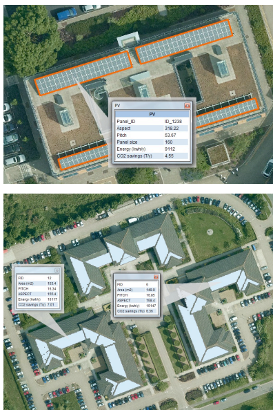
Fig. 2. Satellite data showing solar PV potential

The Appathon is competitive and has a time element. Whilst traditional hackathons are intense sessions occurring over a short period of time, we will in the first case run an Appathon over several classroom sessions to allow feedback and a better understanding of the problems. Students will be given access to the satellite data set and will be tasked with designing an App based on one concrete visualisation. An example of a visualisation can be seen in Fig. 2.