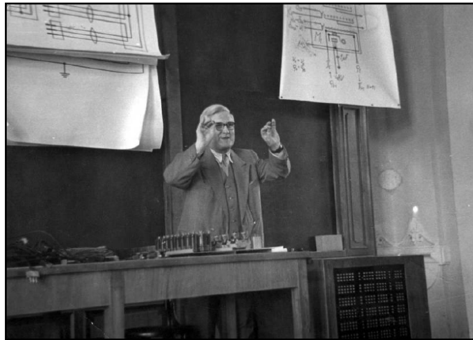
Fig. 3. Kalmár during a lecture [53].

It seems that Kalmár introduced his first fictional computers independently from the well-known idealized computers in the literature as his first versions predate the publication of some of those. It is clear, however, that he was interested in and indeed did follow the literature (see Appendix D ) on them. However, he preferred to use a whole set of his fictional computers for the following reasons. In class, the students were required to solve different problems on different fictional computers, depending on the pedagogical purpose. For example, the set of operations could be rather restricted if the goal was to show that certain operations are expressible in terms of others. This made it impossible to exploit particular “nice” features of the formalism of the idealized computers in the literature. At the same time, it prepared the students to adapt easily to any kind of computer they ended up working with, which was important for two reasons. First, although there were only a few computers in the country at the time, there were many different models. This continued to be a challenge for the successive years as well. For example, by 1969, there were still only 86 computers in Hungary, but this small selection was comprised of thirty different models [52, p. 7]. Second, computers and programming languages were changing quickly at the time, so this method made it easy not only to adapt to the several different models, but to the computers of the foreseeable future as well.