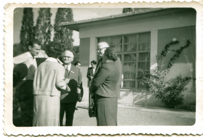
Fig. 2. A picture showing Kalmár and Church, taken by András Ádám at the Colloquium on the Foundations of Mathematics, Mathematical Machines and Their Applications, Tihany, 11–15, September 1962. (picture published with Ádám’s approval.)

of Cybernetics. 3 In 1963 he founded the Cybernetics Laboratory , which grew rapidly after the arrival of the M-3 computer to Szeged in 1965, and later became the first computer center outside the capital. In 1967, another research group was founded in Szeged to conduct research in mathematical logic and automata theory.