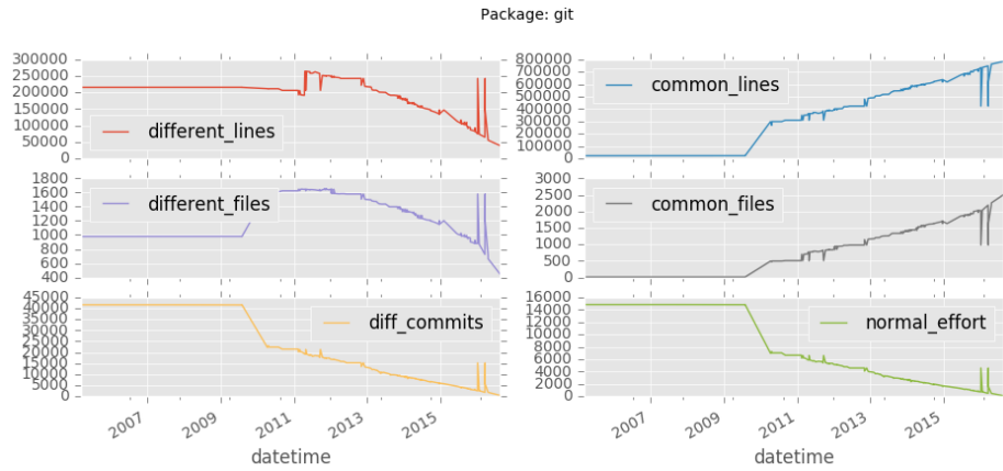
Fig. 2. Lag functions applied to Debian Git package releases, by release date

commit upstream). The last two functions capture how many changes (or, to some extent, effort in changing) were applied to the component in the standard distribution since the upstream release used to build the deployed package.