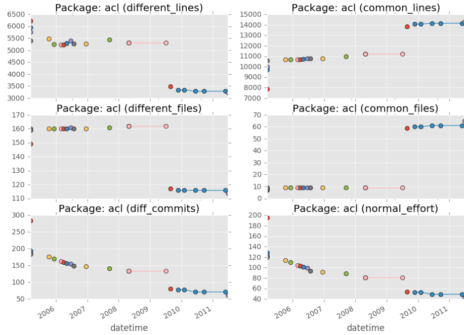
Fig. 3. Lag functions applied to all releases of the Debian acl package, by release date, organized by version

from GNU Interactive Tools (horizontal line in the left) to the “real” Git is now evident.