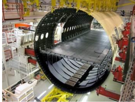
Fig. 2. Image of Airbus A350 XWB rear fuselage Section 16 at the assembly station

The Left Side Shell (LSS) have approximate 14 meters long and 5 meters of cord on the frontal frame, and it is positioned at the assembly station by 12 hoisting points, that can generate a rigid body translation and rotation to the part or that can be independently activated, moving each actuator at a time on a flexible movement. These hoisting points are the positioning control points of our problem definition, as shown on the figure 3. The requirement points are position characteristics, in the points of the part contour and along selected frames, and force characteristics, at the actuators location.