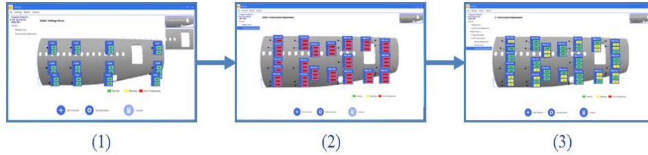
Fig. 4. FITFLEX software workflow

obtaining the rigid body move and flexible move that should be applied on the jig actuators to get a LSS position compliant to the requirements, shown on Figure 4 third image.