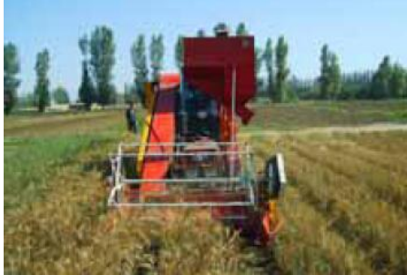
Fig. 4. Hanging harvester in China

University and two-row ridge harvester in Mexico. These two harvesters can not only ensure the harvest quality, but also keep ridge bed [2].