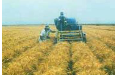
Fig. 5. Two-row ridge harvester in Mexico