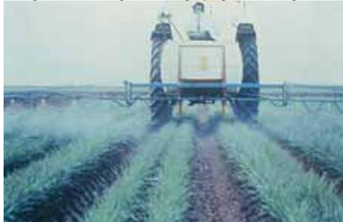
Fig. 3. Mexico sprayer for sunken controlled traffic farming system

Figure 3 shows the sprayer for sunken controlled traffic farming system in Mexico. The spraying is finished during crop growth season to control weed and insects; furrow is used for guide, which improves the spraying with overlap and misses [2].