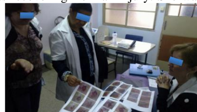
Figure 3: Photos using personal cell-phone to document physiotherapy results.

One important observation made during the design session with the physiotherapist (Feb 23, 2012) is that she disclosed that she had recently used the camera on her cell phone to take photos of one of her patients recovering from an injury. She was planning to show some of the photos at a conference. However, she decided to print the photos and put them in a photo album documenting healing progression. One day, she showed the album to her colleagues that stimulated discussion and how they could use this approach for their patients (Figure 3). As discussed below, this is an example of appropriation of the technology, suggesting that the camera interface itself has natural properties.