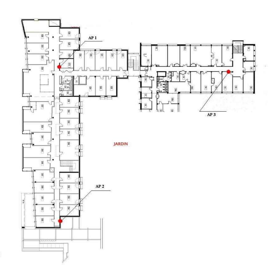
Fig. 1. Test environment: hallway in research laboratory

are located as shown in figure 1 where AP1 is at the beginning of the vertical hallway, AP2 at its end and AP3 is in a lateral hallway that is orthogonal with the test hallway. All access points are at height 231 (cm) above the ground.