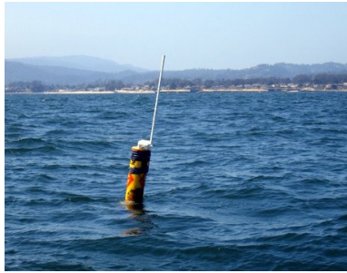
Fig. 2. POD attached to buoy during Monterey Bay deployment