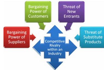
Figure 1. Porter’s Five Forces Model 11

The threat of new entrants in this case is high. Lots of online social networking sites are being/have been launched, since the time Ning was launched, and the trend